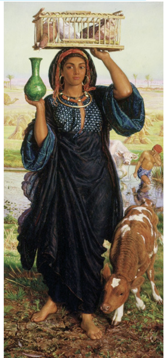
This painting is called 'Afterglow in Egypt'. It was painted by William Holman Hunt in 1861.

? What did you like best on your visit today and why?