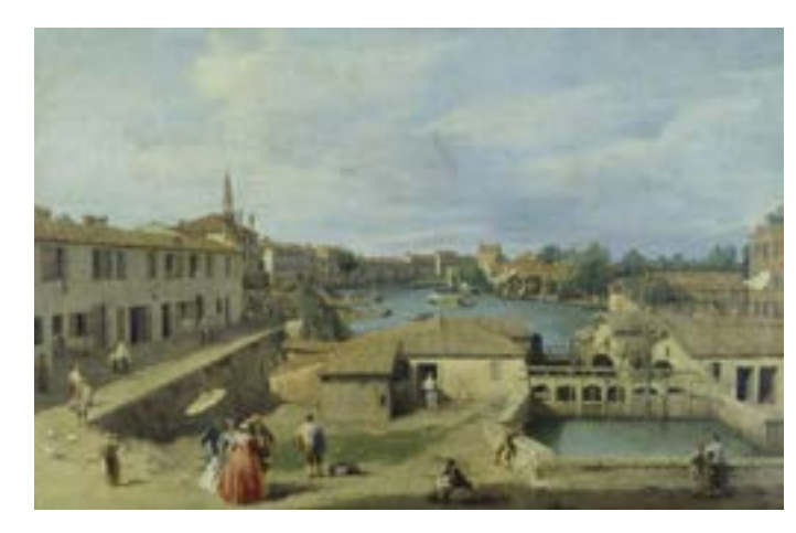
'View of the Dolo on the Brenta Canal,' by Giovanna Antonio da Canal, or Canaletto was probably painted in the early 1730s. The Brenta Canal, lined with elegant villas, was the gateway to Venice for visitors arriving from the north. Guardi also painted a version of this scene.

Guardi's work was aimed at the Grand Tourist market. Well-off travellers at this period would look for souvenirs to send back home from their travels in Italy, and would build up art collections as a sign of social status. They were on the hunt for classical art such as copies of famous Greek and Roman sculpture, or newly-excavated antiquities, coins and gems. Many of them also wanted to buy landscape paintings to remind them of the picturesque places they had visited. Most travellers would spend a few weeks in Venice as they arrived in Italy or on their way home. As a sea-faring Republic whose wealth had derived from maritime trade, Venice had special resonance for British visitors.