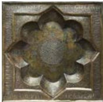
A tray or table top inscribed with good wishes. This object is made of brass, engraved, and inlaid with copper and silver.