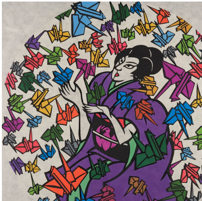
◀ Dancing Cranes Takahashi Hiromitsu (2017)

Enjoy your celebration for longer by requesting a late licence.