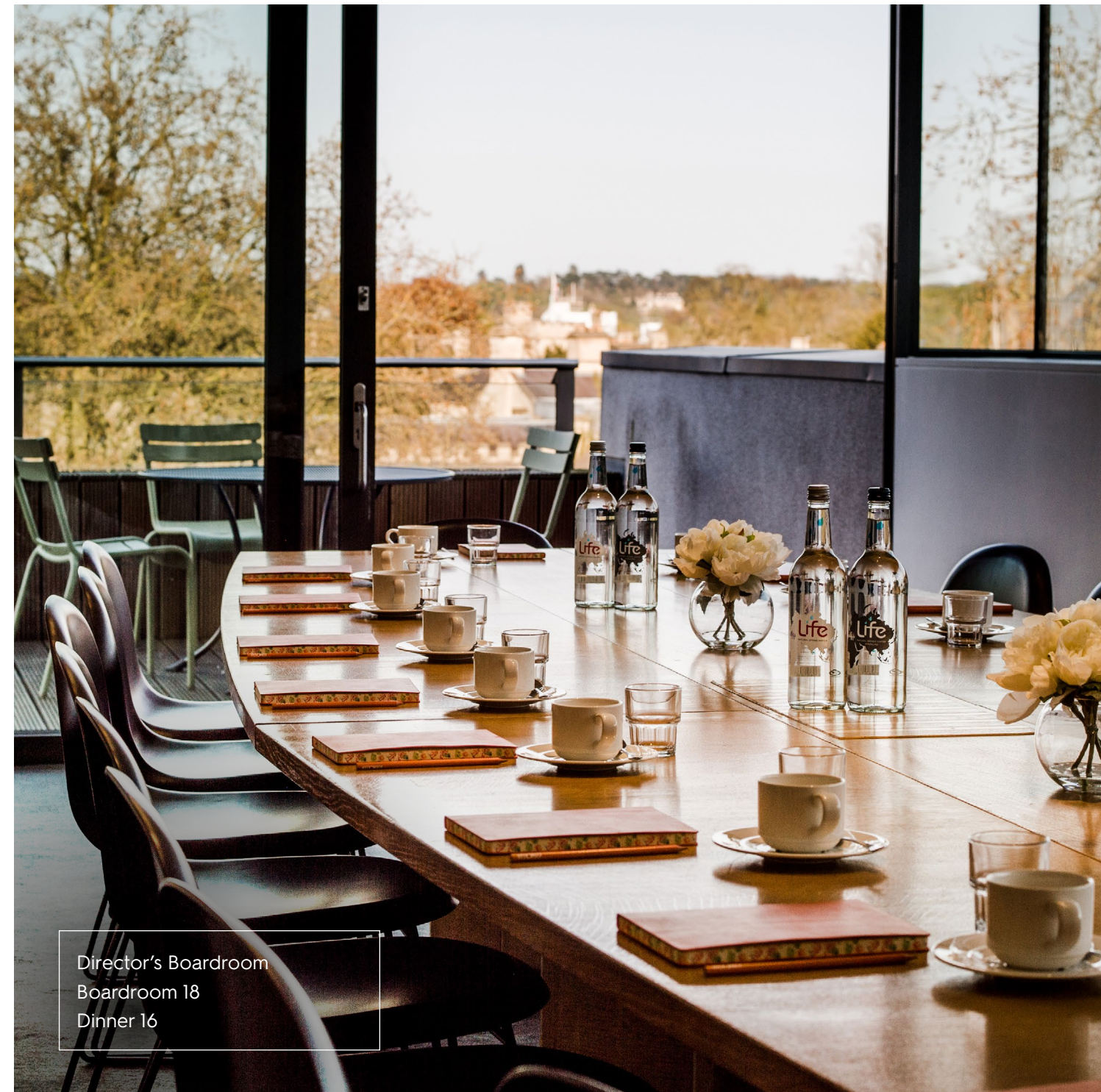
Director's Boardroom Boardroom 18 Dinner 16

Both spaces are available for daytime and evening events.