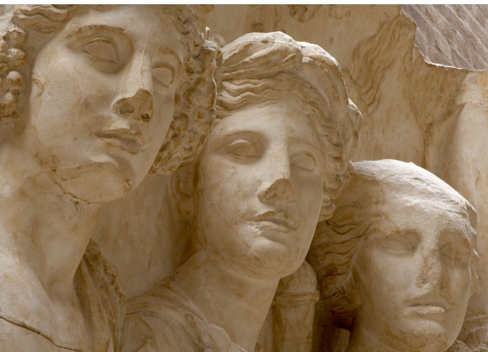
◀ Gods of the countryside Arch of Trajan at Beneventum, AD 114 | Cast Gallery