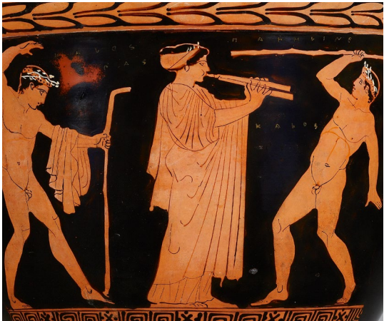
◀ Attic red-figured bell krater (440 BC - 430 BC)

Over the years we have developed relationships with trusted partners who support events at the museum. This means we can offer our clients a list of hand-picked suppliers and creatives who share our values and meet our high standards. Familiar with our event spaces, they will work with your ideas and bring them to life in the museum. Before considering a partnership, we ask about sustainable policies; what they are doing to reduce their own carbon footprint and how we can work together towards more environmentally sustainable events.