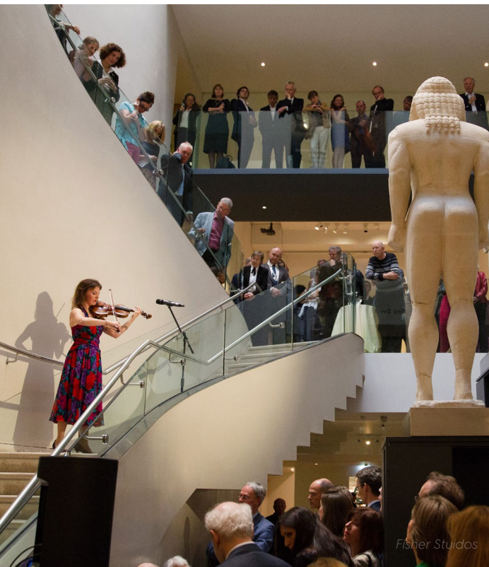
Apollo ► Cast of Apollo from the Temple of Zeus at Olympia | Central Atrium