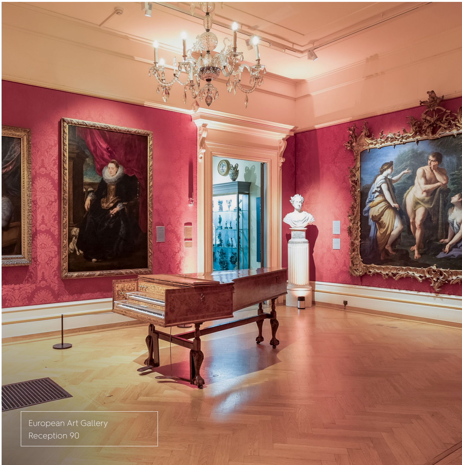
European Art Gallery Reception 90