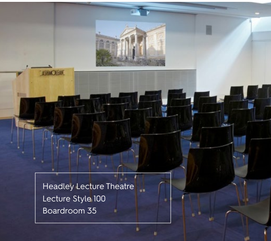
Headley Lecture Theatre Lecture Style 100 Boardroom 35