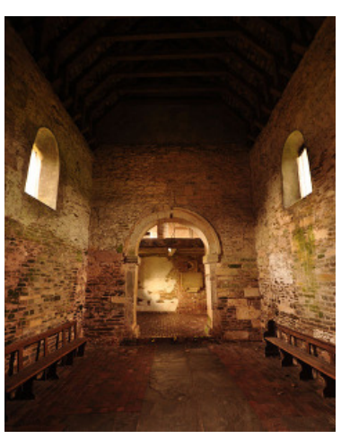
Interior of the chapel. The repica Odda Stone is displayed beyond the arched doorway.

Deerhurst has two Anglo-Saxon churches. Sometime in the 7th century a Saxon monastery was founded at Deerhurst and St Mary's was the church associated with the monastery. In about 970 the monastery was refounded as a Benedictine priory and then in 1059 Edward the Confessor gave Deerhurst Priory to St Denis in France. It remained in French ownership until 1443 when it was given to Tewkesbury Abbey. Four monks and an abbot lived at Deerhurst Priory until the Dissolution of the Monasteries in 1540. After that the priory church became the local parish church and is still in use today.