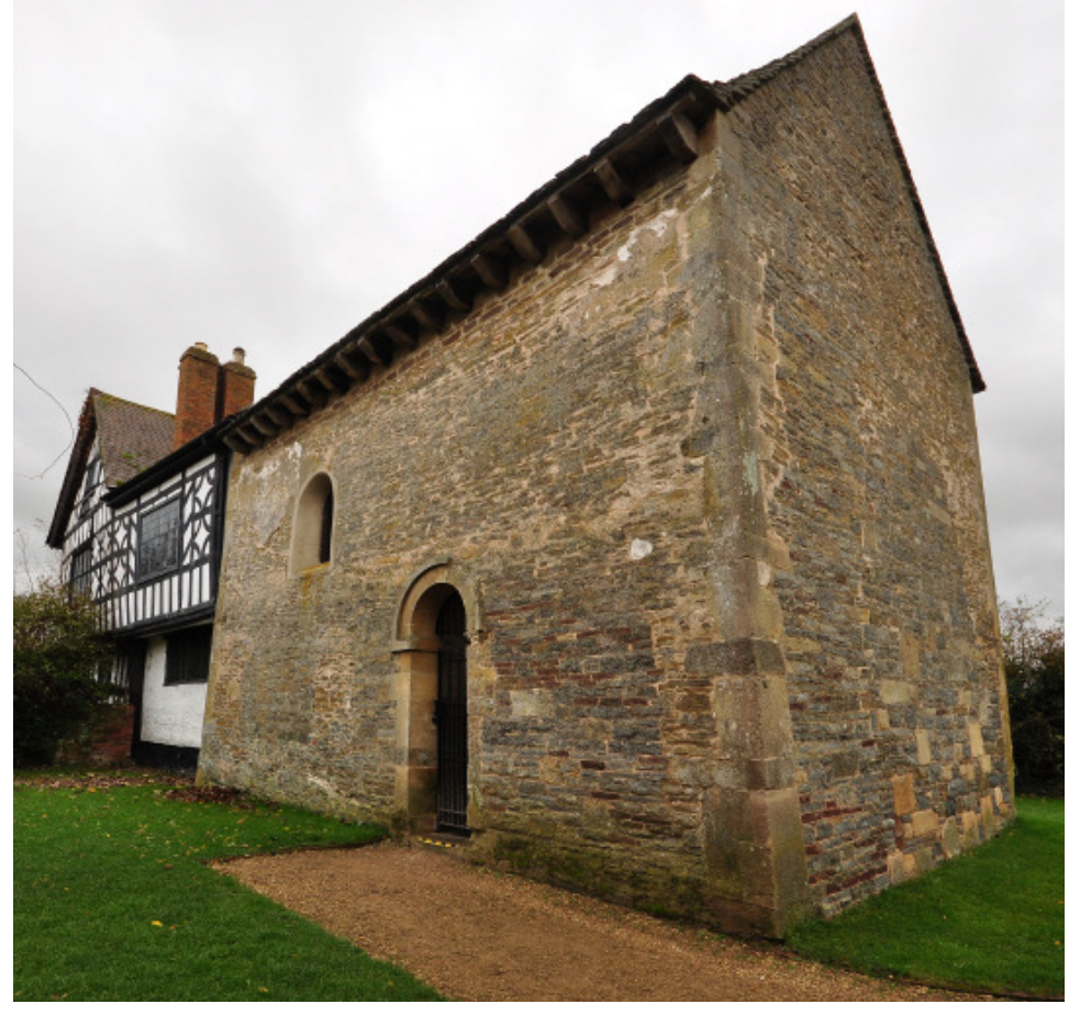
Odda's Chapel. The nave had been converted into a kitchen and the chancel used as a bedroom before the chapel was rediscovered.