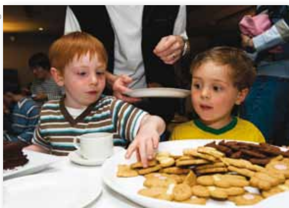
Using our lunchroom: £10 per group

Donations can be made on the day by cash or cheque (made payable to 'The Ashmolean Museum') or by credit card via our website www.ashmolean.org/education/aboutus/howtopay