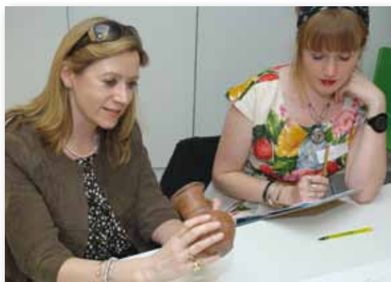
1 day bespoke training day: £100

Donations can be made on the day by cash or cheque (made payable to 'The Ashmolean Museum') or by credit card via our website www.ashmolean.org/education/aboutus/howtopay