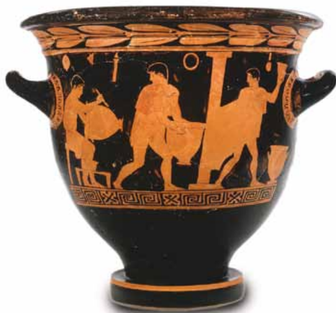
➡ Athenian red figure wine-mixing bowl 5th century BC

Booking: please email adrian.brooks@prm.ox.ac.uk